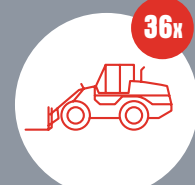
SERVICE TRUCKS, WATER CARTS AND OTHER